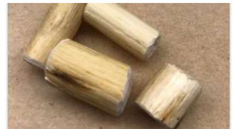
xos cogh natl'ets'i ggaay