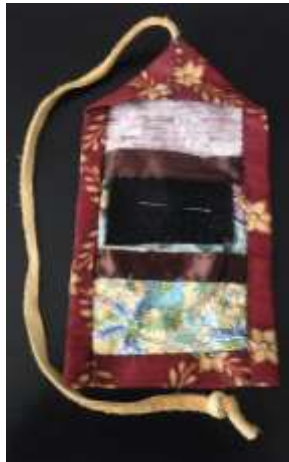
hnaa tsesi/ alcesi