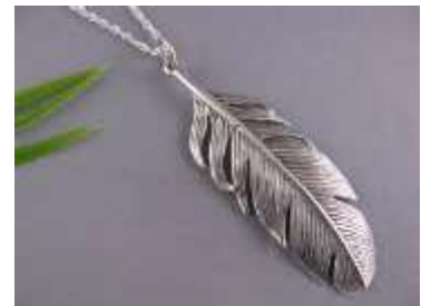
t'aa natl'ets'i ggaay